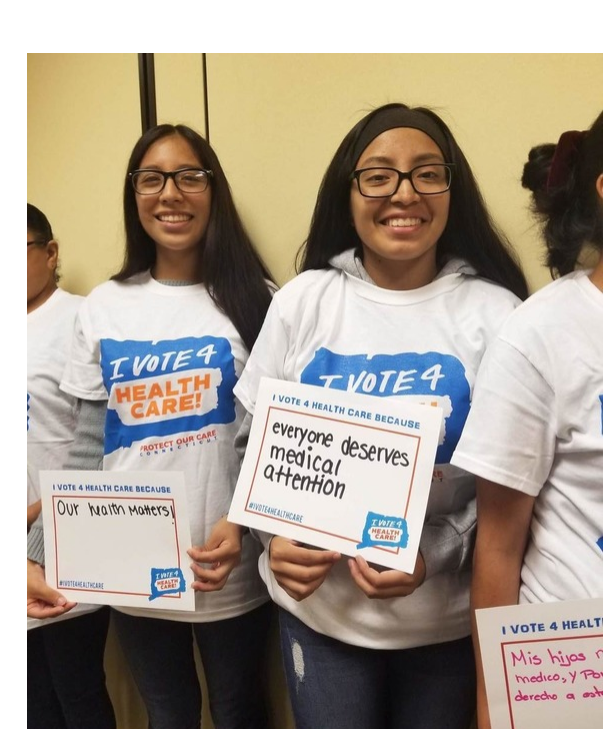
care voter. Happy voting!